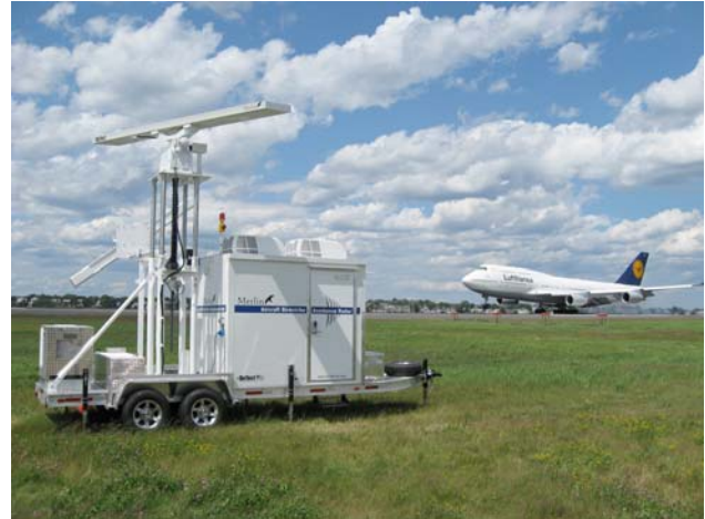
MERLIN Aircraft Birdstrike Avoidance Radar at Logan International Airport, Boston, Massachusetts, USA in July 2009.

If one takes the time to talk to commercial airline pilots, they will tell you that the birdstrike risk