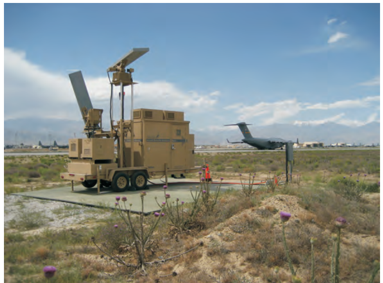
UPPER: MERLIN SS200m mobile system operating at USAF Bagram Airfield, Afghanistan providing real-time birdstrike risk alerting to the 455th Expeditionary Wing.