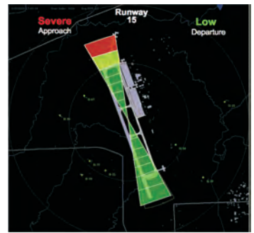
MERLIN includes a wide range of intuitive user displays designed by air traffic controllers & pilots.

With MERLIN, users get more than just a radar - each MERLIN system is supported by DeTect's experts in military and commercial aviation safety, air traffic control, airfield management, airfield bird control and radar remote sensing to provide a cost-effective system that integrates seamlessly and effectively into airfield or airport operations.