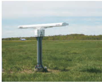
MERLIN systems are available in both mobile & fixed airfield installation designs.

DeTect's MERLIN Aircraft Birdstrike Avoidance Radar system is the most advanced, proven and widely used bird radar technology available for real-time detection and tracking of hazardous bird activity at commercial airports, military airfields, military training and bombing ranges. The MERLIN bird radar is proven, production model technology with over 60 systems currently operating at sites worldwide in aviation safety and bird control applications with documented results in reducing birdstrikes and aircraft damage and delay costs. MERLIN is the only production-model bird radar in operational use for real-time, tactical bird-aircraft strike avoidance by air traffic controllers that includes systems in operation at both commercial airport and military airfields .