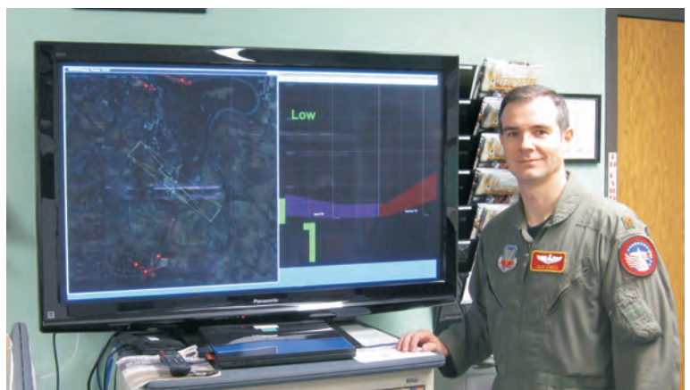
LOWER: Large format real-time Flight Safety Office display of bird activity around airfield with current risk level for the runway flight corridor.

specifications subject to change without notice - contact DeTect for current product catalog & specification